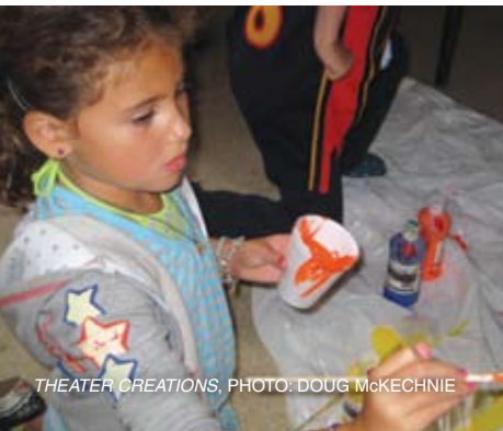
THEATER CREATIONS.

Each day of this two-week camp will be a fabulously fun day of enriching theater experiences. Working together as an ensemble, we will engage our bodies and imagination through acting, dancing, music and visual art. Theater Creations will culminate in an original piece of musical theater based on one of America's great Tall Tales. Our final performance will celebrate our work as a creative community.