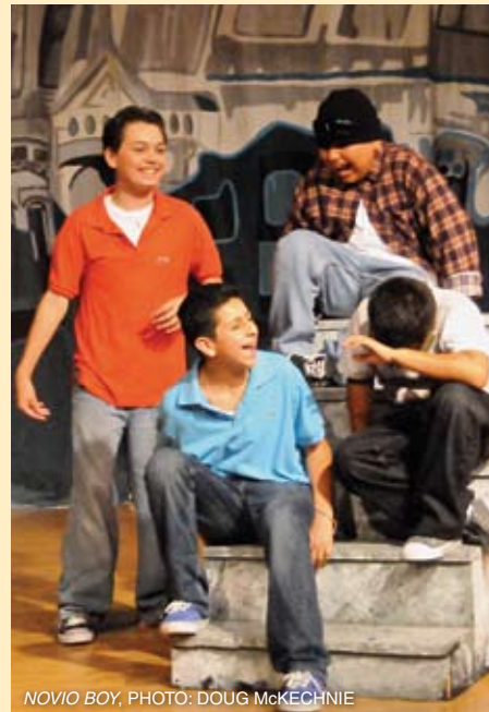
NOVIO BOY.

Join Marsh Youth Theater for an inspired program of dance, theater, music and visual art. MainStage Summer will create an original musical theater production born of our own imagination and creativity. Our Story will be shaped through student-inspired stories and writing. Students will have opportunities to direct, choreograph dances, compose music and design sets. Discover all the elements that go into an original musical theater piece!