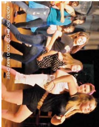
NOVIO BOY

1062 Valencia Street San Francisco, California 94110 www.themarsh.org