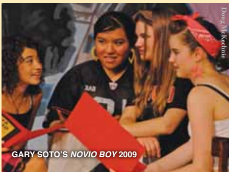
GARY SOTO'S NOVIO BOY 2009