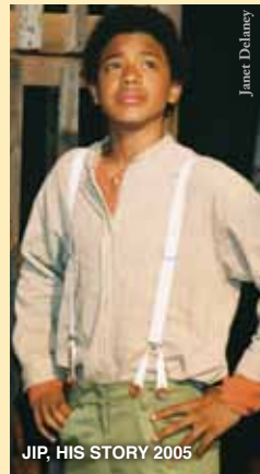
JIP, HIS STORY 2005