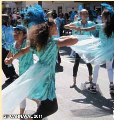
SF CARNAVAL 2011

Persephone Cubana will culminate in two weekends of spectacular performances for the community.