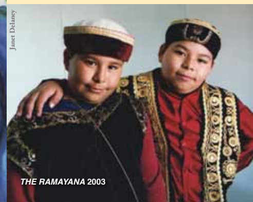
THE RAMAYANA 2003